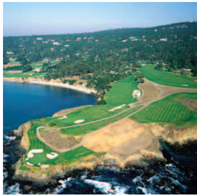
"Play" the famed Pebble Beach course at Terminus' virtual golf fitness club, including the precipitous seventh hole.