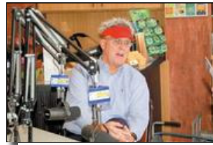
Neal Boortz sports a visor with fake fluff over his bald head during his May 19 broadcast. ( click for larger version )