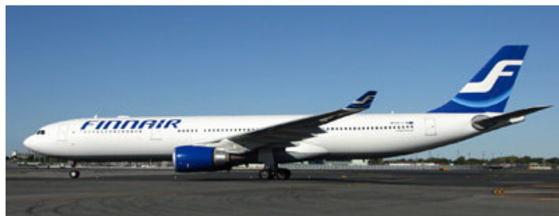
Finnair A330-300.

Finnair broke a streak of seven consecutive quarters in the red by posting third-quarter net income of €32.4 million ($44.7 million), reversed from a loss of €18.1 million in the year-ago period. Revenue lifted 26.2% year-over-year to €551.4 million.