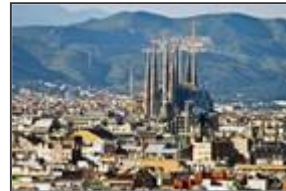
Gaudi's Sagrada Familia dominates the skyline.

A pair of package trips | Airlines and by Tourcra Spain within easy reach