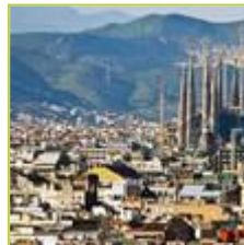
Gaudi's Sagrada Familia dominates the skyline. -

Contact the author to o